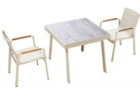
3801180(incl. 4chairs + 1 table)